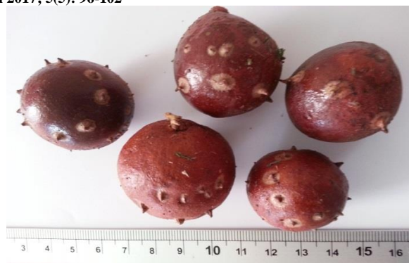
Fig (1): Gall of Quercus infectoria Olivier collected from Erbil governorate, Kurdistan region of Iraq.

Plant material: Quercus infectoria olivier galls (Figure. 1) were collected locally from Qalasnj village on Safeen Mountain in Erbil governorate in September and December 2015 and authenticated by Professor Saleem Shahbaz, Taxonomist, University of Duhok. The galls were washed with distilled water, left dry at room temperature before they were crushed and ground prior to the extraction.